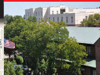
Walk to Court House